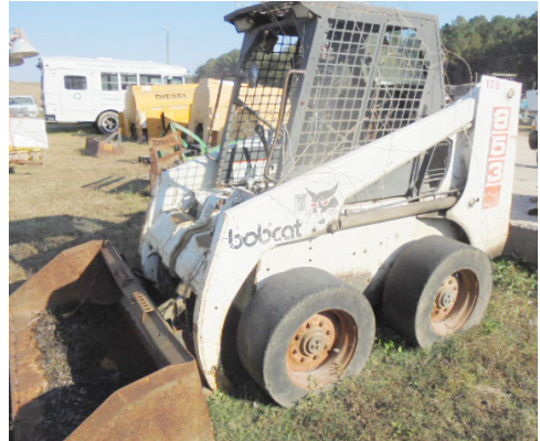
ALL ITEMS WILL BE SOLD WITH NO RESERVES.

Con Cover Pump Power Boss Model I SS /88-I D Single Axle Trailer w/Sand Blasting Pot Trailer w/Diesel Engine Pump Station w/Diesel Engine & a Crane Pull Type Magnet Sweeper 853 Bobcat Skid Steer Diesel Powered Air Compressor Napa Air Compressor w/ a Honda Engine Front Deck Mower