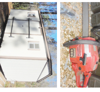
6385 NC 27 East Coats NC 27521