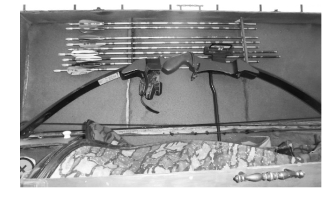
All State, Federal and Local Firearms Laws Will Apply.

Ranger 12ga Vent Rib Pump Shot Gun Mitchell Md 9105 12ga Pump Shot Gun Maverick Md 88 20ga Pump Shot Gun Winchester Md 1300 20 Pump Shot Gun New England 12ga Single Barrel New England 410 Single Barrel Winchester Md 1400 20ga Semi Auto Remington 8/70 Express Magmas 12ga Vent Rib Ruger 22 Pistol Semi Auto Browning 22 Pistol Semi Auto Cas Pran Colt 45 Auto Vintage 38 Revolver Black Powder Pistol H&R 22 Revolver Browning 22 Semi Auto Pistol