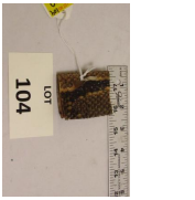
104: Book of Snake skins

Nice Colonia hunting knife in leather sheath. 10" L