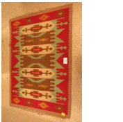
93: Southwestern Rug

Marked Brooks Brothers, Sheffield, C S N 1862. Iron head with hardwood handle.