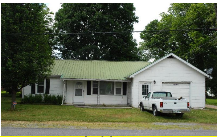
305 E. Lauderdale St. - 5:30 PM

Directions: From N. Jackson St turn East on Hogan St, right on N Polk St & look for auction signs.