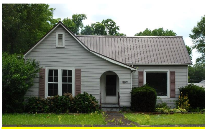
409 N. Polk St. - 5:00 PM

<u>THURSDAY, JUNE 28<sup>TH</sup> – 5:00 PM & 5:30 PM</u> 409 N. POLK ST & 305 E. LAUDERDALE ST – TULLAHOMA