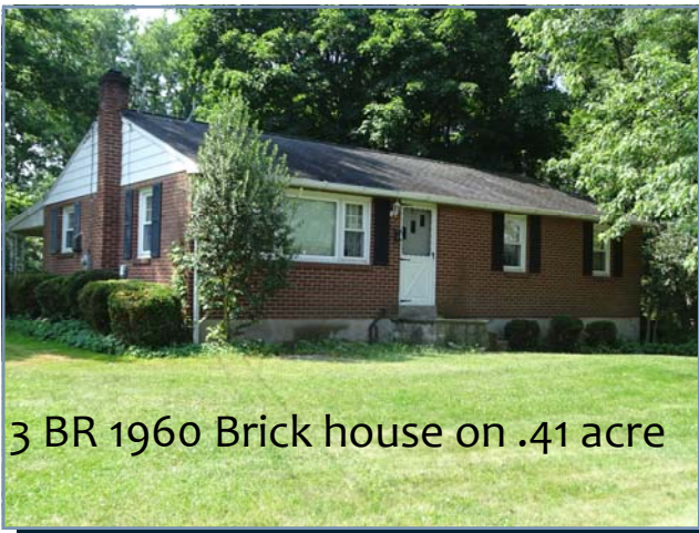
3 BR 1960 Brick house on .41 acre