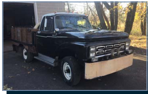
1964 Ford F250 Truck