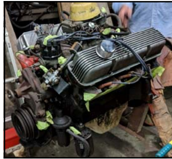
428 Ford Engine