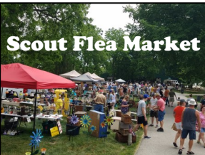
Scout Flea Market

LIVE AUCTION — begins at 11:00 am The items listed above (along with many more not listed) will be auctioned inside Smith Hall beginning at 11:00 am. There will be approximately 10 hayracks of items in addition to the Model T, Tracker Boat, household & furniture. GATES DO NOT OPEN UNTIL 10:00 AM. THERE IS A $2 ENTRY TO THIS EVENT WHICH INCLUDES BOTH FLEA MARKET & AUCTION. FOOD, REFRESHMENTS, LIVE MUSIC & KIDS ACTIVITIES! BRING A FRIEND!